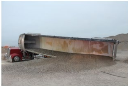
Photograph: Trailer tipped over onto cab of tractor.

On January 2, 2024, the driver of an over the road tractor-trailer haul truck died when the trailer tipped over onto the cab of the tractor. The driver was dumping part of the load of gravel from the trailer. Between 2018 and 2024, mine operators reported 14 injury accidents where over the road trucks tipped or rolled over while dumping. During the same period, miners were also injured when 28 off-road mine haul trucks tipped or rolled over. The accidents can be prevented with proper training and following best practices: