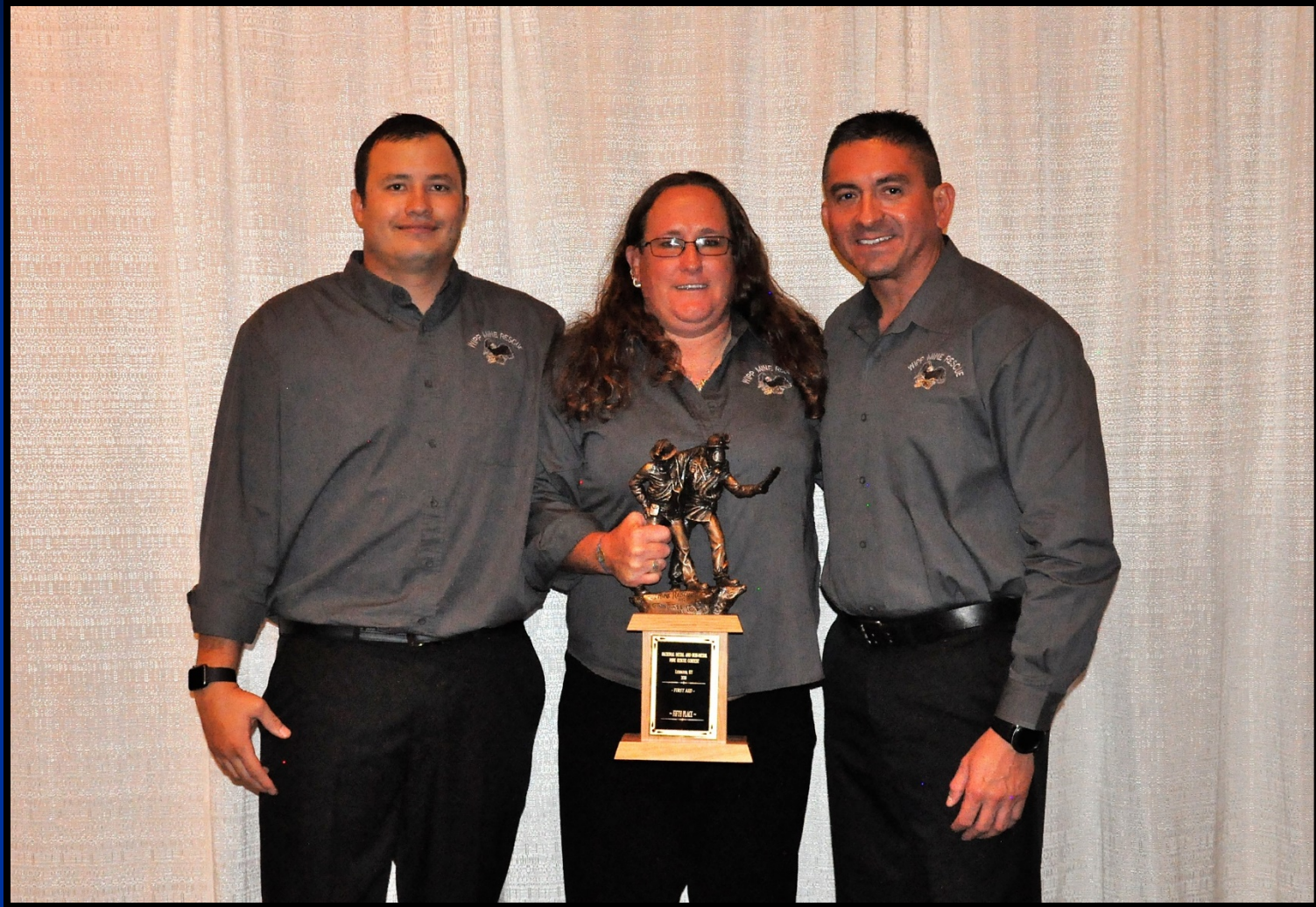
FIRST AID FIFTH PLACE WIPP/NWP – WIPP BLUE