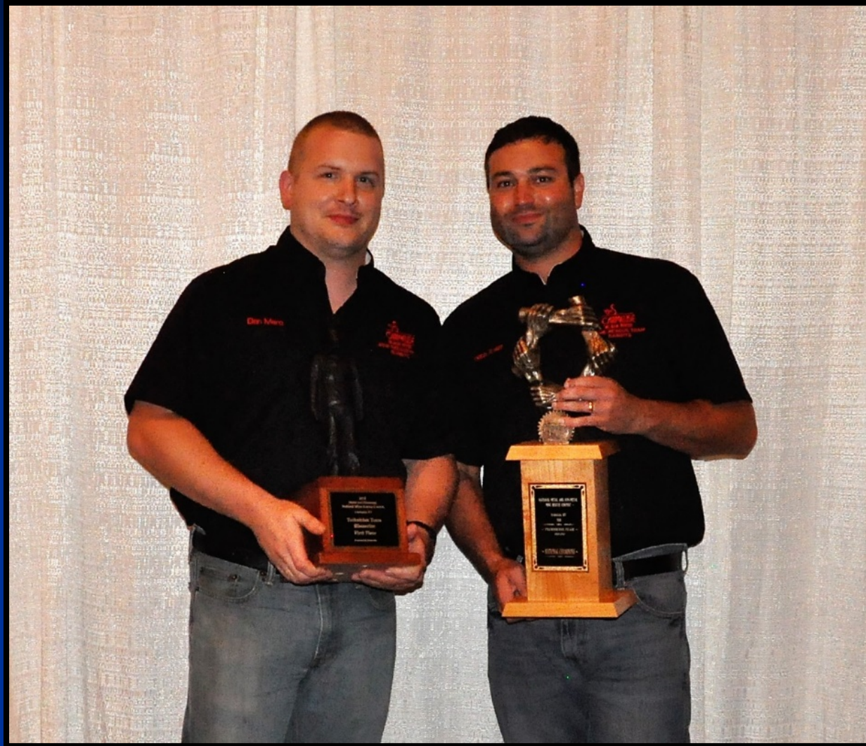
TECHNICIAN TEAM BIOMARINE NATIONAL CHAMPION CARMEUSE BLACK RIVER BANDITS