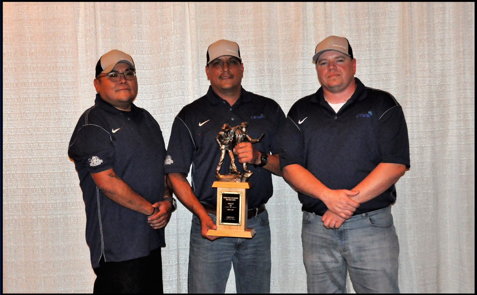
FIRST AID THIRD PLACE CINER WYOMING – CINER BLUE