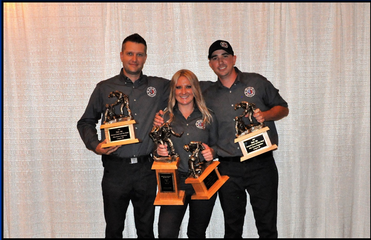
FIRST AID NATIONAL CHAMPION BARRICK GOLD – BARRICK CORTEZ