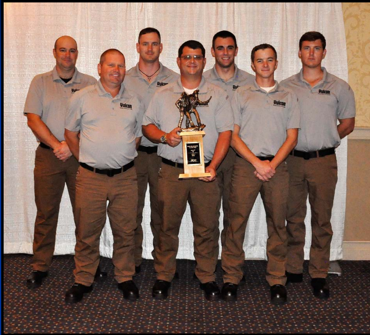
NOVICE FIRST PLACE VULCAN MATERIALS - VULCAN GRAY