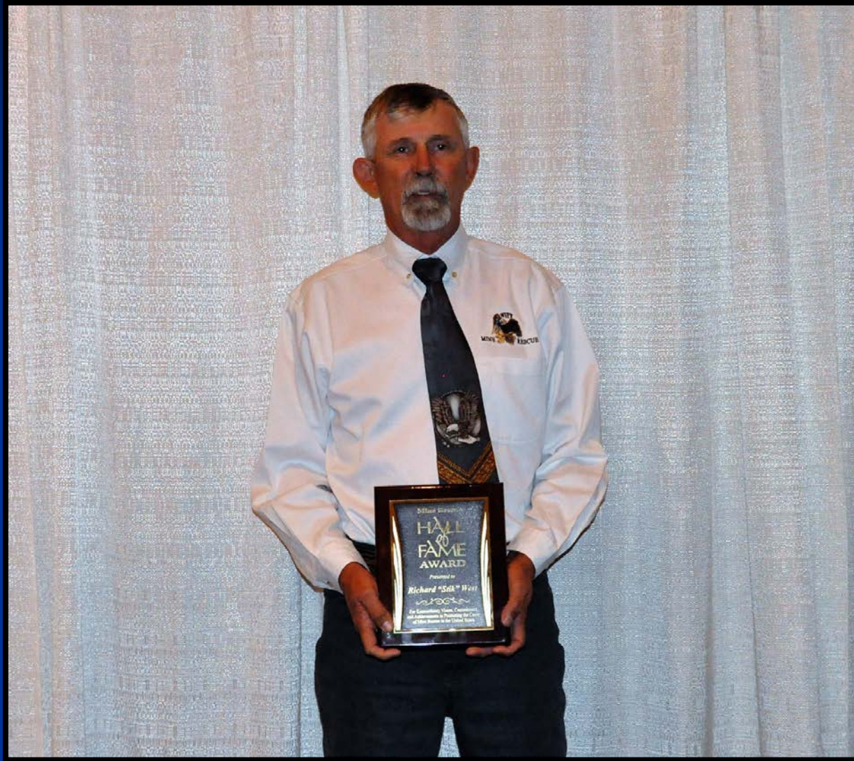
HALL OF FAME RICHARD "STIK" WEST