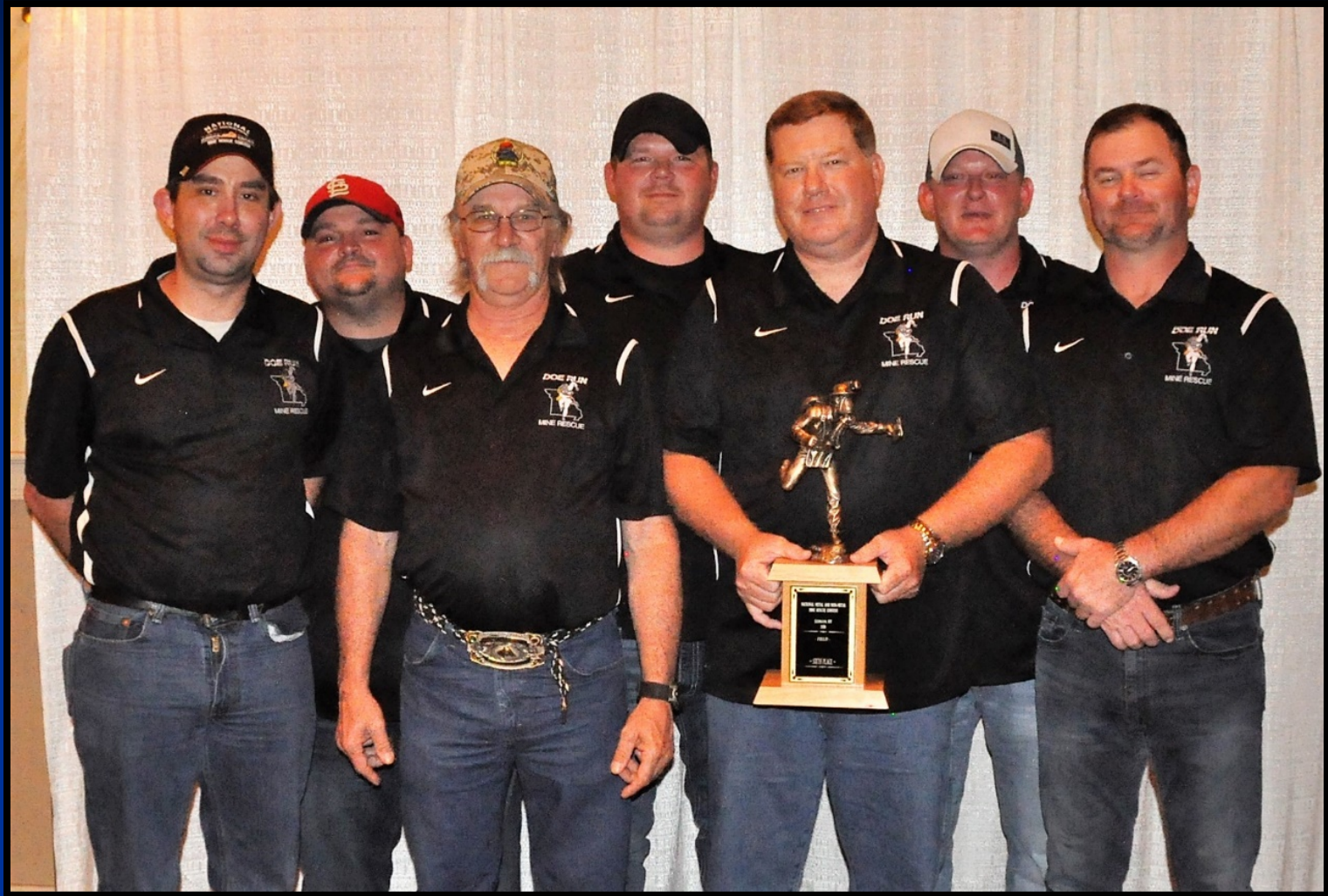
MINE RESCUE SIXTH PLACE DOE RUN – DOE RUN GRAY