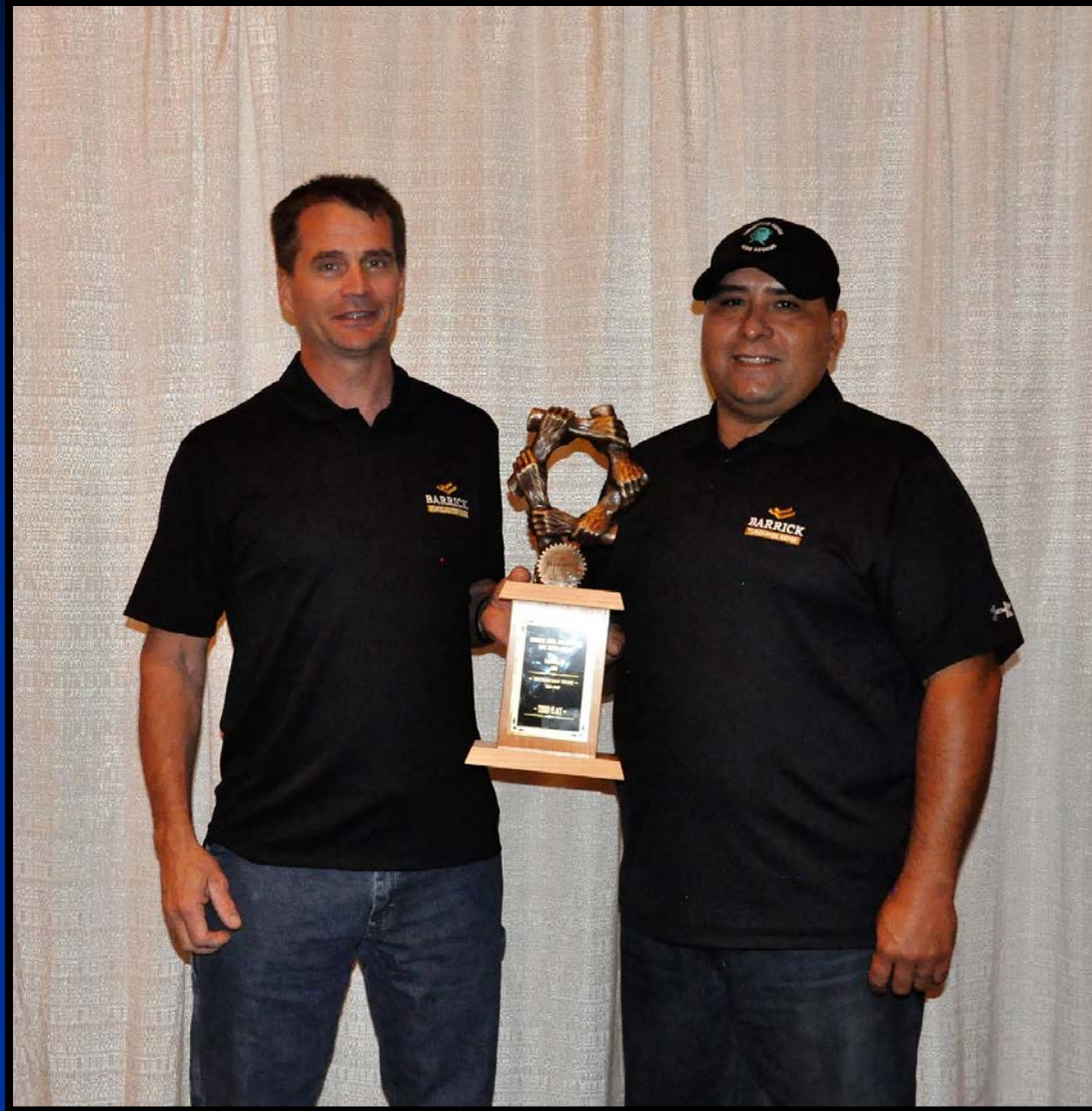
BIOMARINE BIOPAK 240 THIRD PLACE BARRICK TURQUOISE RIDGE