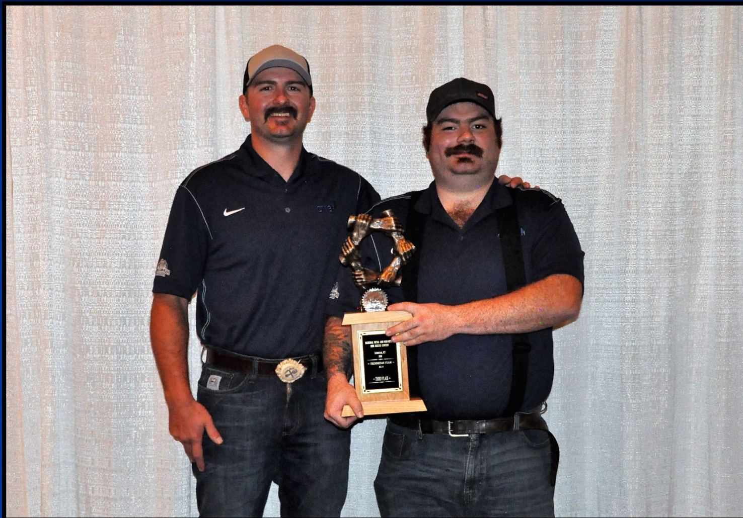
DRAGER BG-4 THIRD PLACE CINER WYOMING - CINER WHITE