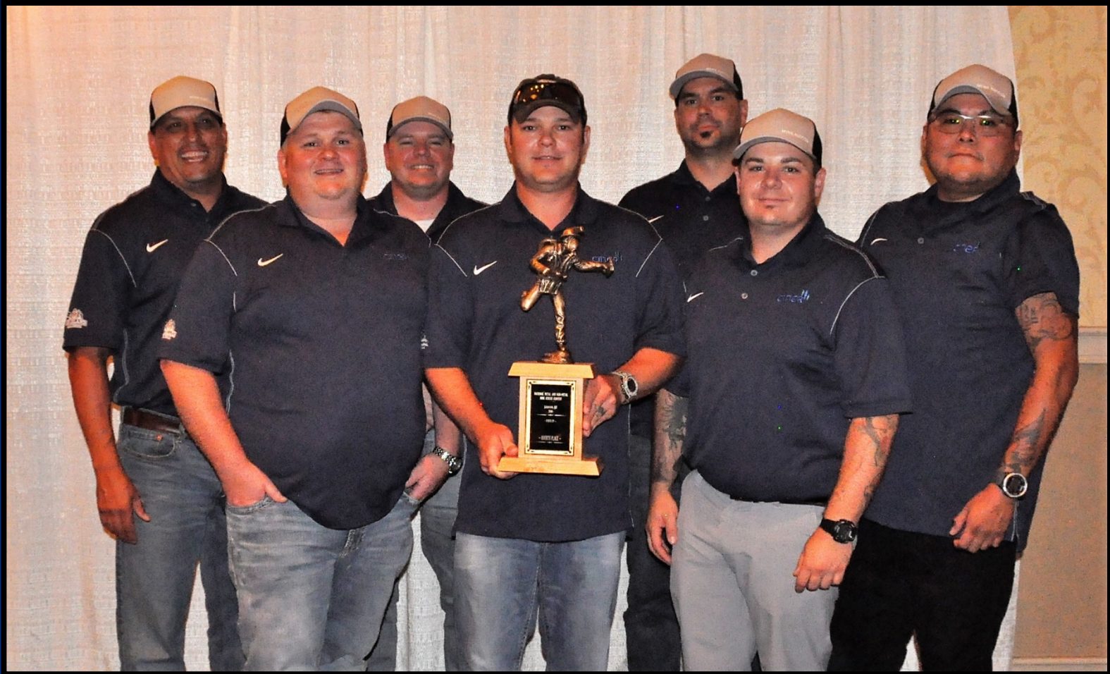
MINE RESCUE FOURTH PLACE CINER WYOMING – CINER BLUE