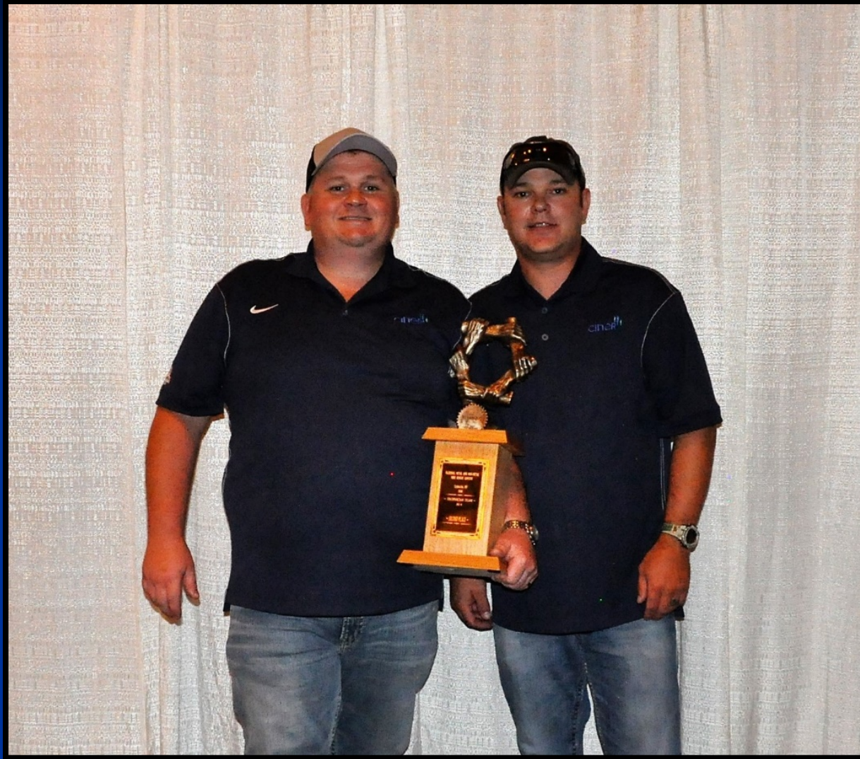
DRAGER BG-4 SECOND PLACE CINER WYOMING - CINER BLUE