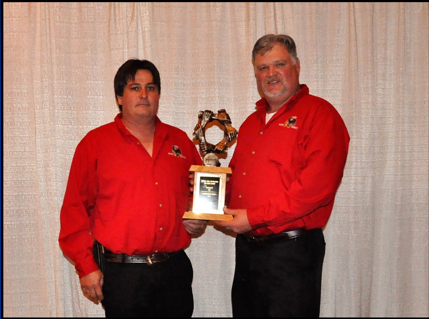
DRAGER BG-4 SIXTH PLACE WIPP/NWP - WIPP RED