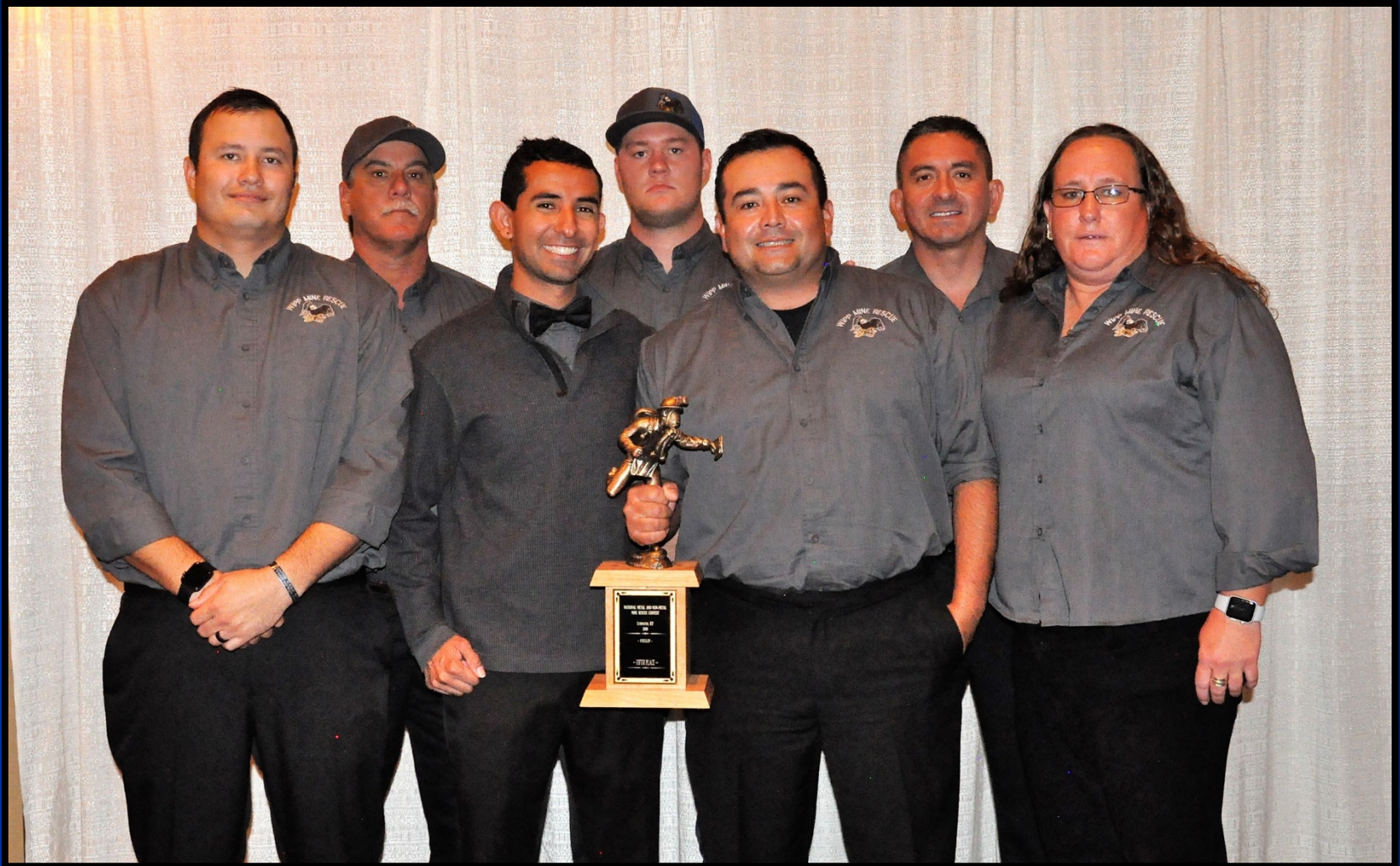
MINE RESCUE FIFTH PLACE WIPP/NWP - WIPP BLUE