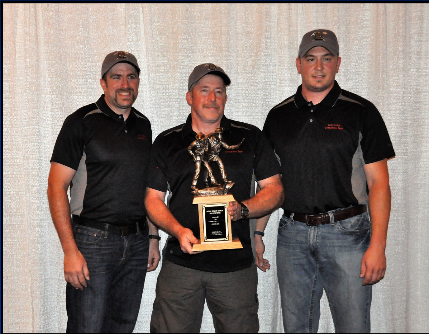
FIRST AID FOURTH PLACE HECLA LIMITED – LUCKY FRIDAY