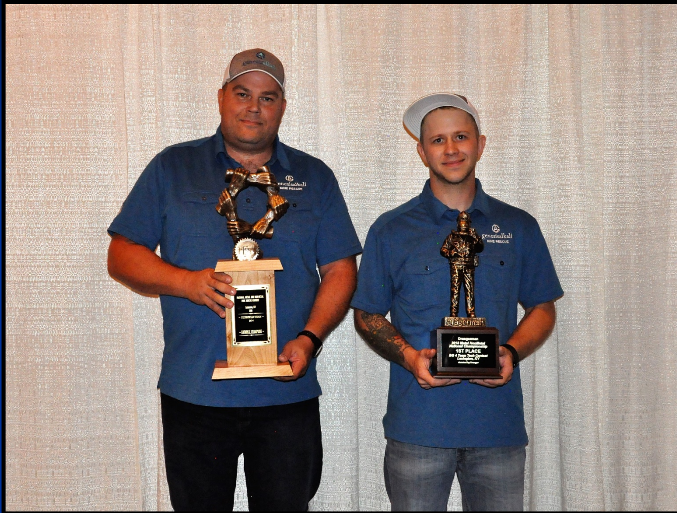
TECHNICIAN TEAM DRAGER BG-4 NATIONAL CHAMPION GENESIS ALKALI - GENESIS TEAL