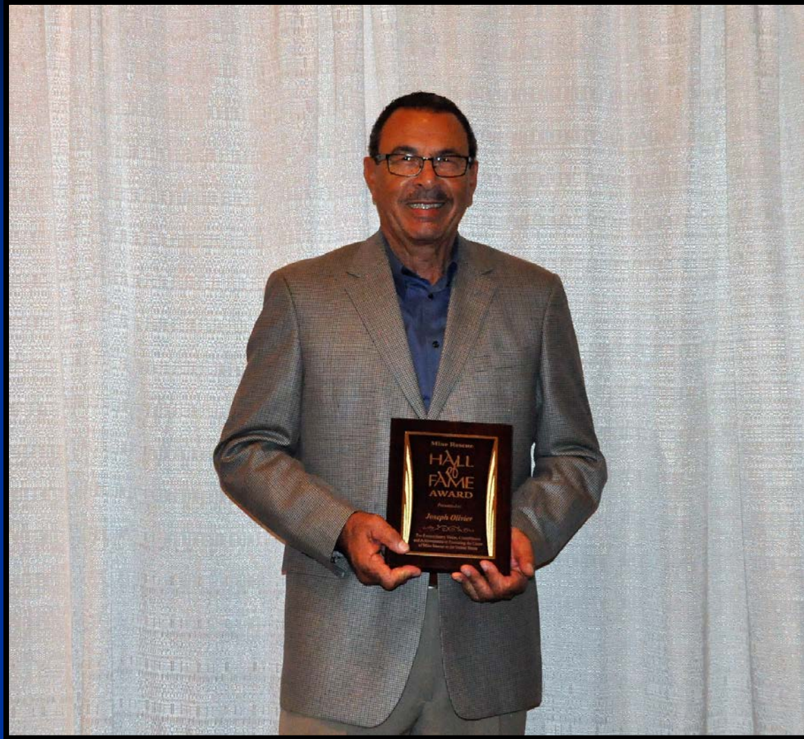
HALL OF FAME JOSEPH OLIVIER