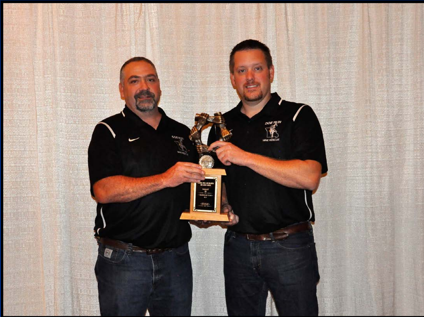
DRAGER BG-4 FIFTH PLACE DOE RUN MAROON