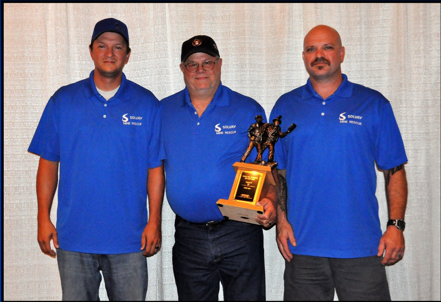
FIRST AID SIXTH PLACE SOLVAY CHEMICALS - SOLVAY BLUE