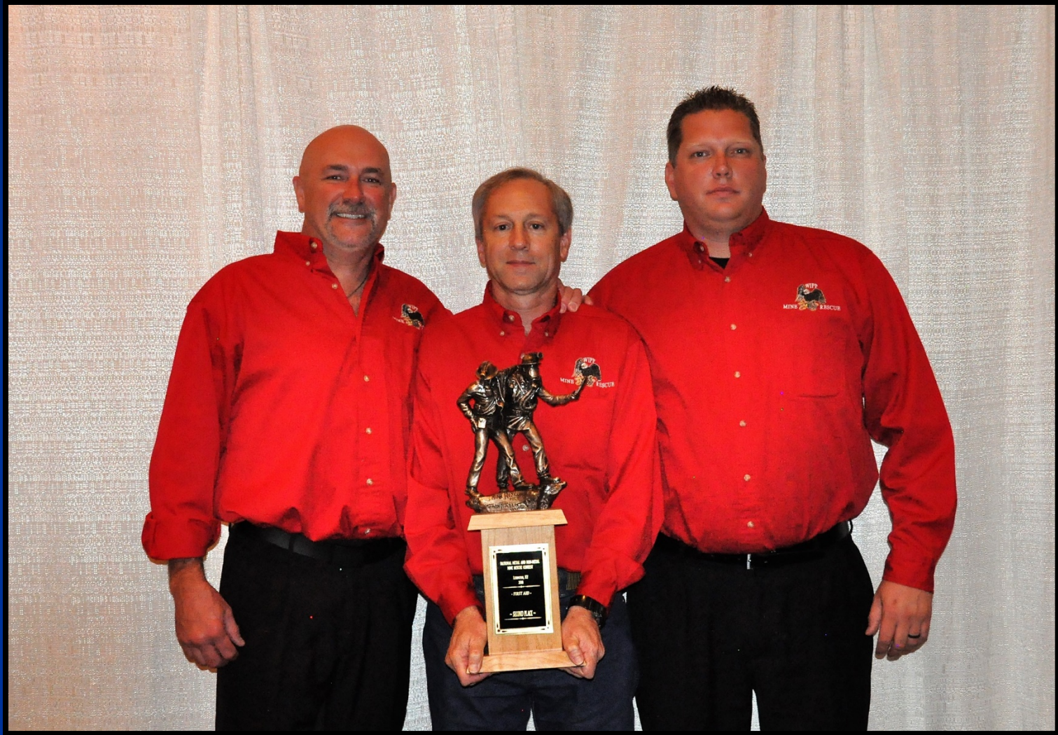
FIRST AID SECOND PLACE WIPP/NWP – WIPP RED