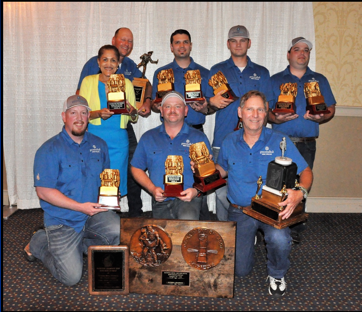
MINE RESCUE NATIONAL CHAMPION GENESIS ALKALI - GENESIS BLUE