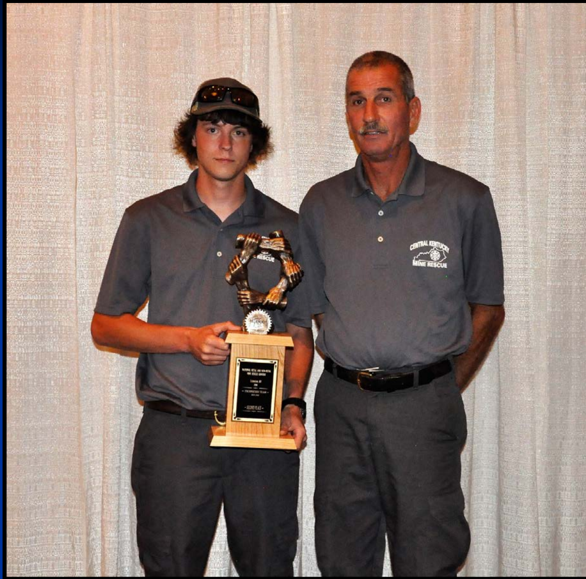
TECHNICIAN TEAM SECOND PLACE CKMRA - EASTWOOD FIRE DOGS