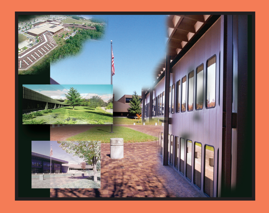
Dedicated to the Health and Safety of the Nation's Miners