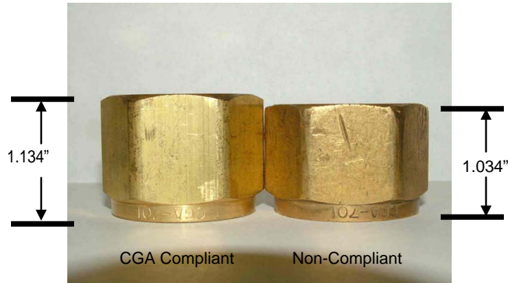
Figure 1 Measured length (shown upright) on CGA compliant and non-compliant high pressure oxygen fitting (nut)