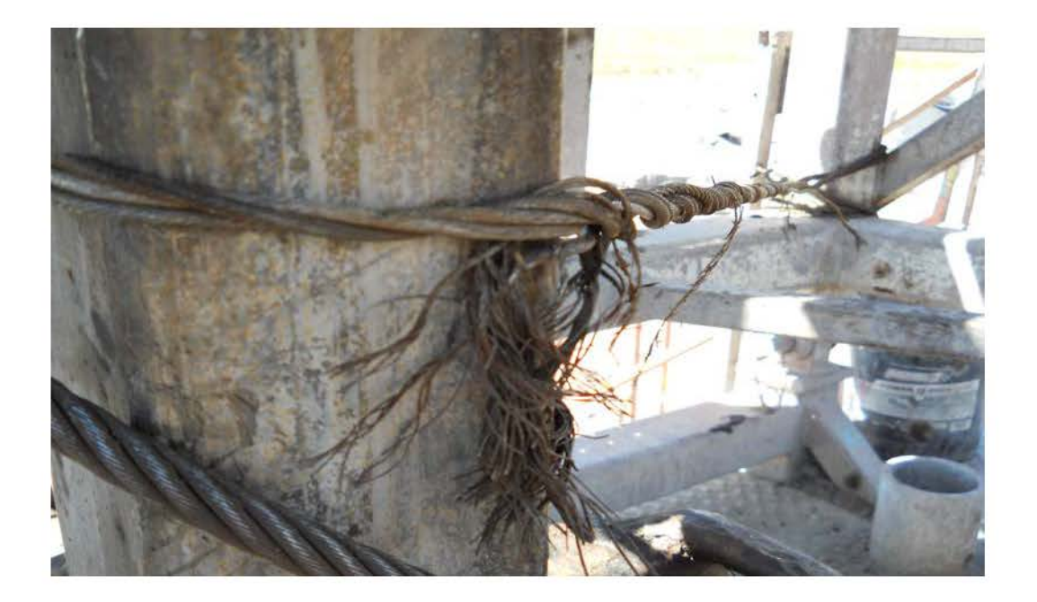
FIGURE 5: Snub Cable after Failure