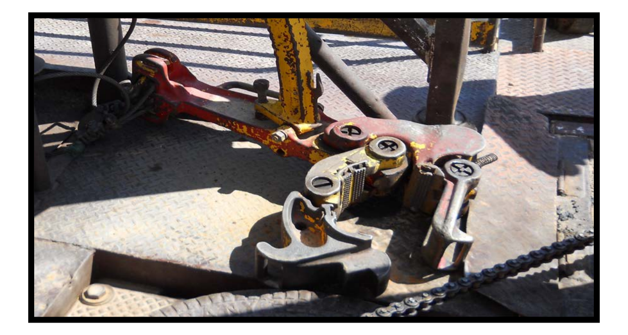
FIGURE 2: Demonstration of Tong Installation