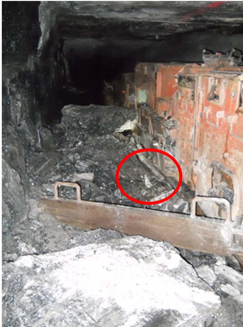
Approximate Location of Victim