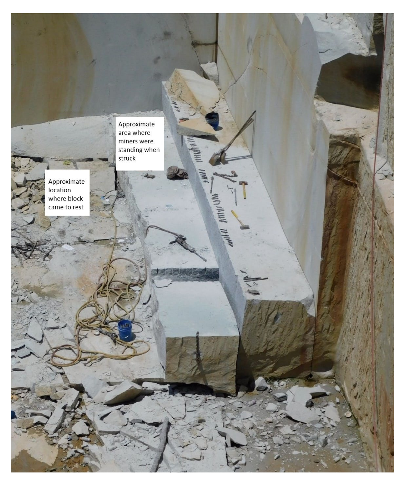
APPENDIX C – Overhead View of Accident Scene