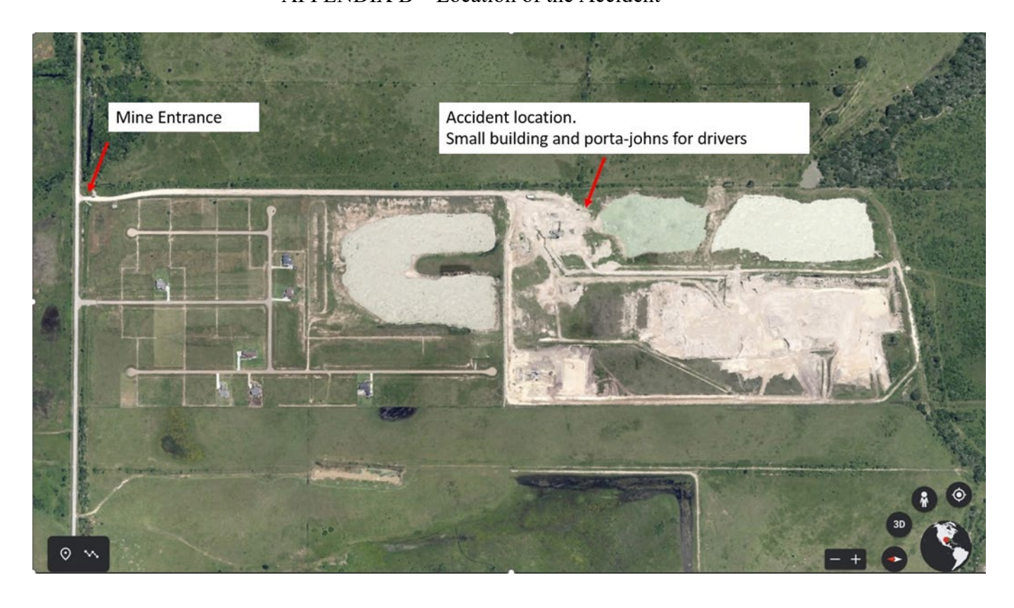
APPENDIX B – Location of the Accident