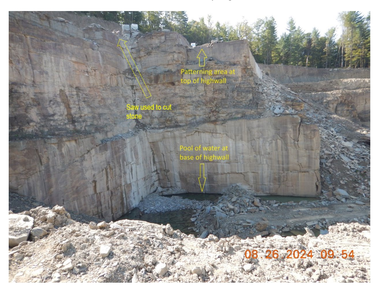
APPENDIX A – Quarry Highwall