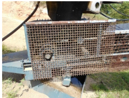
The opposite side of the tailpiece.