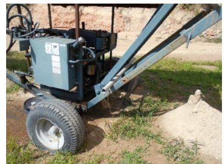
The hydraulic and diesel components of the sand conveyor.