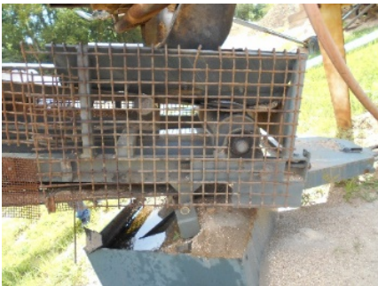
The guard that was removed from the tailpiece at the time of the accident.