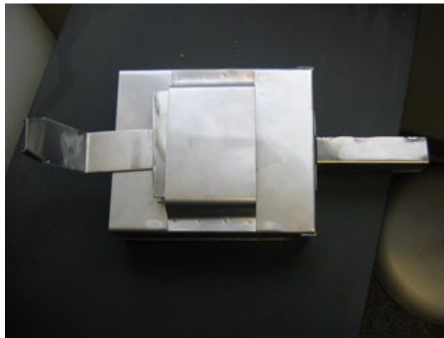
Figure 4-4: Tool for Collecting Dust Samples from Roof, Ribs, and Suspended Items

A specialized tool may be used to collect dust samples from the roof, ribs and suspended items in areas that are difficult to reach. An example of such a tool is shown in Figure 4-4 below.